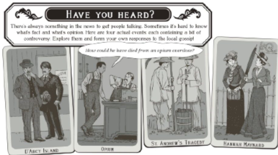
Figure 4: Part of the introductory page to the events.

gossip. The learner, being a member of society, is invited to form a personal opinion of the gossip. On the page, titled "Have you heard?" navigation to each of the four events is a picture of two members of society gossiping about the event. On rollover a speech bubble appears, showing the gossip and the prompt for the issue to be considered (see figure 4). Participating in local gossip is more appealing to a sixteen-year-old than following instructions such as "consider this topic when working through the event."