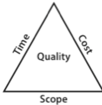
Figure 1: Project Triangle

But how does one measure the performance requirements or quality of an e-learning project? Ultimately, it is by how well the learner engages with and achieves the objectives of the project. Therefore, in managing e-learning projects, the learner is the fourth constraint—measurement of requirements and quality—in the project triangle, as shown in Figure 2.